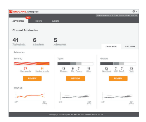
Advisory summary gives rapid access to the reasons behind the ratings.

Endgame Enterprise Security Manager guides your security team with Advisories that enable fast, effective investigation and response without requiring expert-level skills and knowledge. It produces guidance that dramatically reduces the signal-to-noise ratio, empowering security teams to take control in real-time. This is a stark contrast from the volume of meaningless alerts generated by traditional security products.