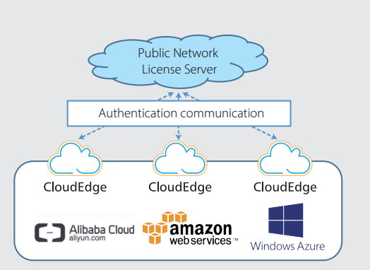
Figure 2. Public Network LMS Solution